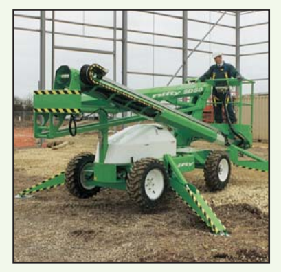
Also available on a self-drivable 2x4 or 4x4 base, the Nifty 170SD.

Fully proportional hydraulic outriggers make setting up and levelling quick and easy even on gradients.