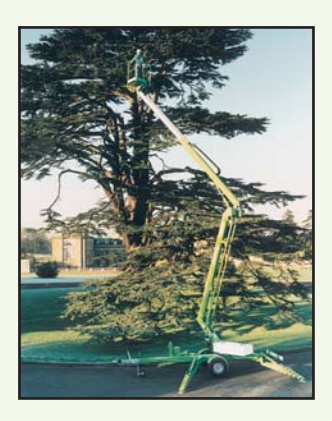
The 170's outstanding reach makes it ideal for a wide range of applications.

Due to a policy of continuing development and improvement, Niftylift reserves the right to change any specification without notice. Please confirm exact specification before ordering.